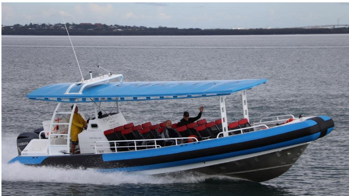
A jet boat similar to the ones to be constructed for tours of Moreton Bay.