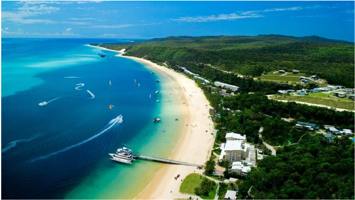
Tangalooma Island Resort at Moreton Island, one of the region’s few tourist attractions.

“We hope by linking the city’s key accommodation areas to the wonders of the bay, we can keep these visitors here a little longer.”